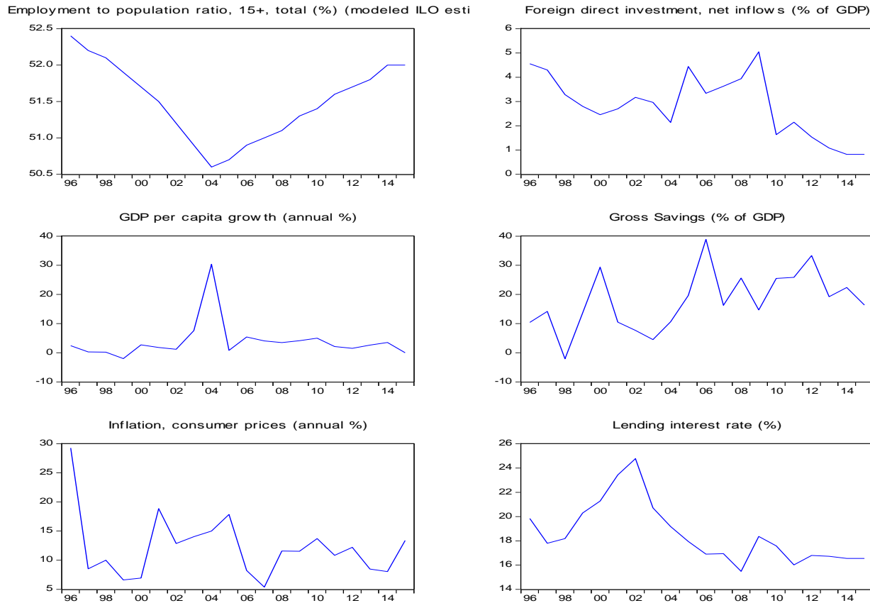
Figure 3: Trend Analysis of Economic Variables

decline in poverty levels, however - over 62% of Nigeria's 170 million people still live in extreme poverty (CIA, 2017). The economic environment of Nigeria will be analyzed vis-à-vis the World and Africa averages of economic variables such as employment, inflow of foreign direct investment (FDI), GDP per capita growth, gross savings, inflation, and lending rate. The figure presented below shows the trend of each of these variables over 1996 – 2015.